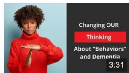
8/ Changing OUR Thinking About "Behaviors" and Dementia