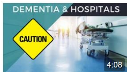
9/ Dementia & Hospitals: Caution!