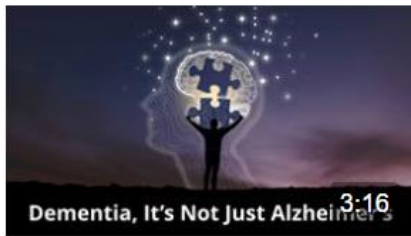
1/ Dementia, It's Not Just Alzheimer's