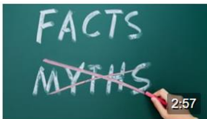
2/ Dementia: Understand the Facts