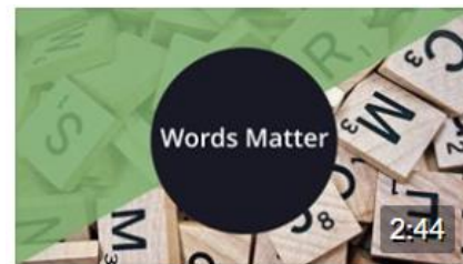
6/ Words Matter: Dementia