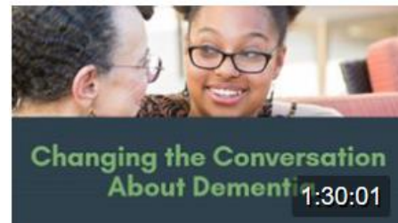
7/ Changing the Conversation About Dementia with a panel including two people living with Frontotemporal Dementia (FTD) and their spouses